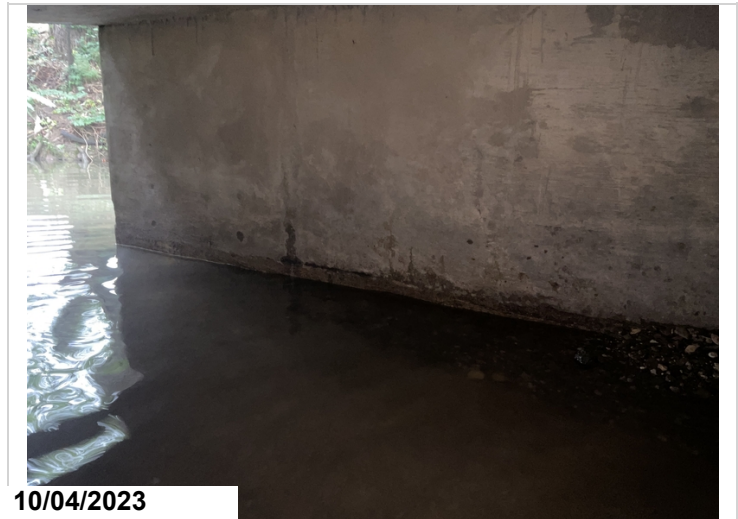
Barrel # 1 East wall has shallow spalling along the base with exposed reinforcing steel.