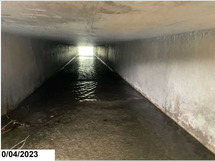
Barrel # 2 typical.