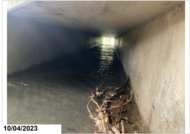
Barrel # 3 typical.