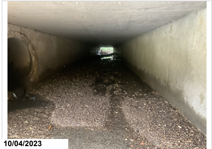
Barrel # 1 typical.