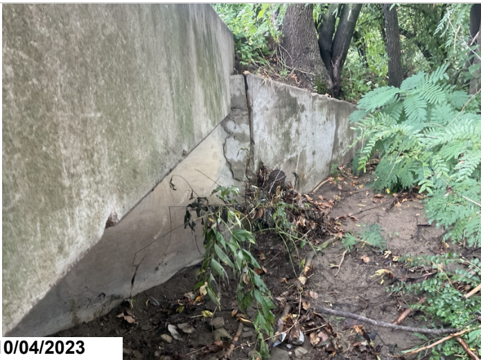
Barrel # 1 Lt end of the exterior wall has a 18" tall delamination at the wing wall juncture.